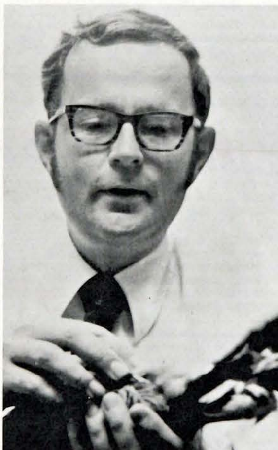
Therefore, the Egrets benefit from the cow with the cow remaining intact.

Dr. Dinsmore conducted a control experiment: Birds feeding alone versus the birds feeding from the cows. By using the cows, the Egrets use less energy for travelling and hunting, not to mention that by using the cow, the Egret gains twice as much food.