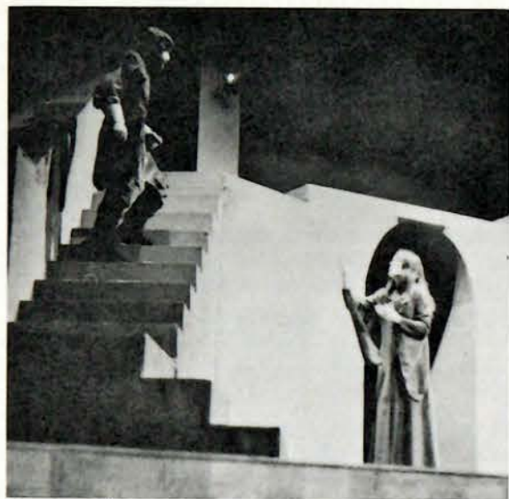
Macbeth Is In Town

Macbeth, William Shakespeare's devastatingly powerful drama of twelfth century royal intrigue and murder, opened this Wednesday at the University of Tampa Falk Theatre. The lavishly staged production is the second offering of the year by the drama department following last semester's successful run of the Moliere classic The Doctor in Spite of Himself .