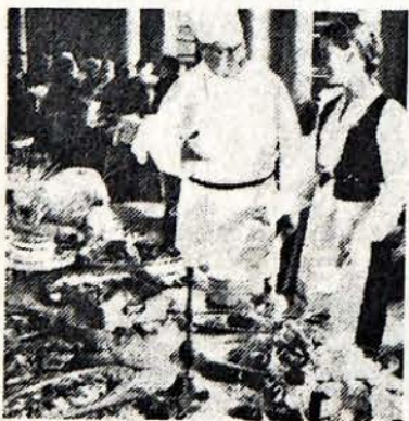
Learning about a European buffet.