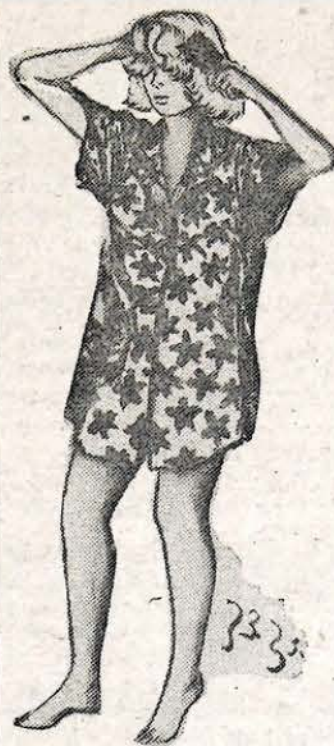
The prevailing fashion of the Dormitory is exemplified by this model.

Yours truly hopes you have had as much pleasure reading this article as the conglomeration who wrote this have had.