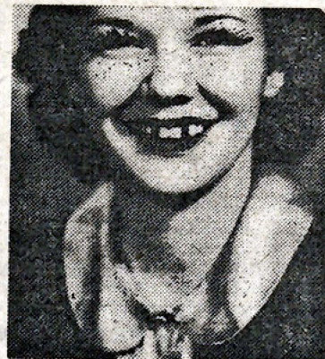
Cut To Fit