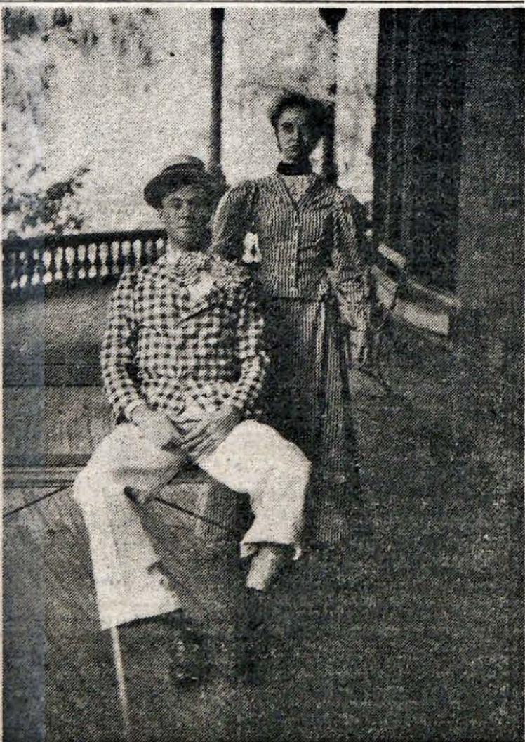
JUST A PICTURE —We couldn't think of any reason to run this. But then we couldn't think of any reason not to—SO . . . .