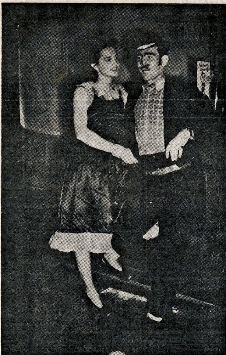
Instead of our regular fashion column, we offer this; new trend in collegiate styles.

SUPERIOR LAUNDRY KEEP YOUR CLOTHES LIKE NEW Plant and Lafayette, Across from the University