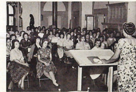
orientation 1961: beanies and words of wisdom

will see, appearances change, even in a few years. Pony tails are now "out" for women but "in" for men. There is a sense of loosening up—hair, clothes, study habits. Even inner posturings seem more free. Encounter groups have replaced formal welcomes, activities are less structured.