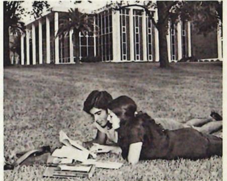
Plato under the palms: 1974