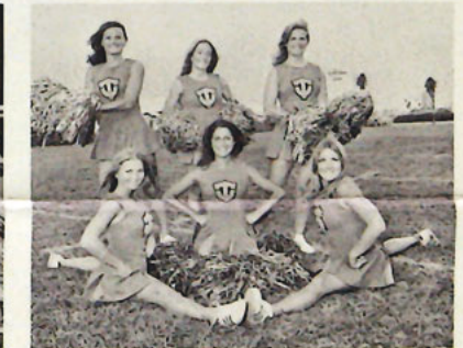
Spartan spirit: 1974