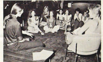
orientation 1974: informal encounter group ("rap session")