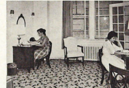
hitting the books: 1950's