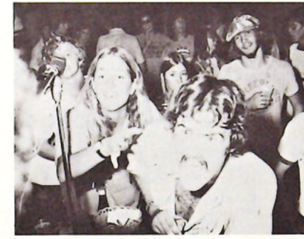
After the trying times of registration and settling in, some of UT's 1,980-plus students still found some energy left to expend in the Rathskeller. This fall's enrollment exceeds the pre-school projection, despite the fact that the University is feeling the shrinking pains that have hit almost every college in the nation. The spirit among the new freshmen and the returning students more than makes up for the somewhat lower population count.