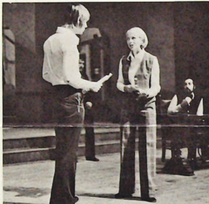
Scene from "The Mousetrap"

A new look at witchcraft and exorcism, once a fanatical preoccupation of our Puritan ancestors, is the subject of the company's second production: "Bell, Book and Candle." The play is scheduled to open October 31, 8:30 p.m., in Falk Theatre.