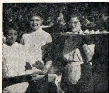
Three coeds working in Europe

Any student interested in participating in this drive should contact Deno Kutumbos, 118 New Smiley Hall.