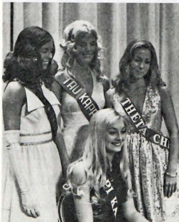
Friday night the four finalists wonder who will take the crown . . .

Unlike the other painters in this series, little is known about the character and private life of the pointillist Georges Seurat (1859-1891), the subject of the fourth film. His life was short and he left little to reveal his private nature, except for his paintings. Lord Clark concentrates principally on Seurat's method of work, subject matter, scientific approach to painting, and relationship to his cultural background and era.