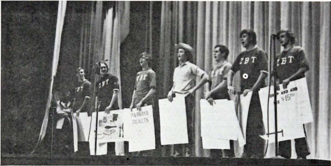
14 Weeks of School at Tampa U — Skit by ZBT grasped third for the night at McKay Auditorium.