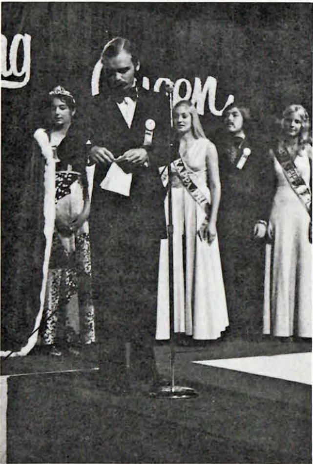
The Moment of Tension