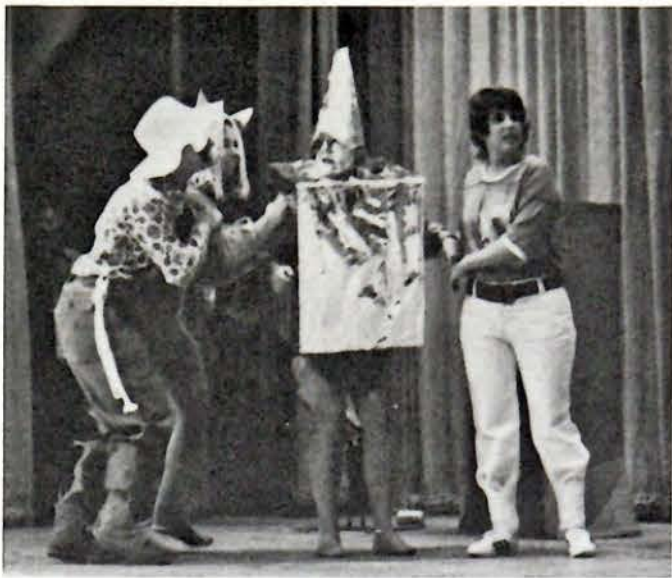
The Wizzard of Tampa put on by Zeta took second place with no trouble.