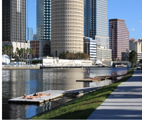
Img 1 : Bowery Bayside (South Tampa)