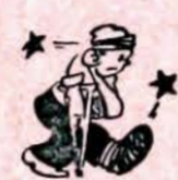
Editor After This Issue