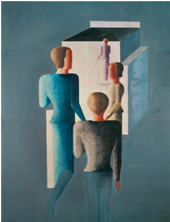
Fig. 3 / 1928, Staatsgalerie, Stuttgart

Oskar Schlemmer was another Bauhaus visual artist. (61) His beliefs about aesthetics were perhaps even more paradoxical than Klee's: Schlemmer felt paintings were "revelations of the divine through the medium of man, known as 'the artist,' a language of forms and colors mystical in origin." (62) Schlemmer identified closely with Renaissance masters and derived some of his techniques and style directly from his interpretation of their own. (63) Thus, he represented two ideas quite suspect to Bauhausers strongly aligned with Gropius's original vision: the sense of the artist as a mediator between God and man, and focus on art with no inherently architectural mission. A characteristic example of his work, Four Figures and a Cube , can be seen to blend geometric and color exploration in a way that not only clashes quite strongly with the Nazi artistic milieu, but also proclaims the artist's interest in painting as a form of art independent from construction. (Fig. 3)