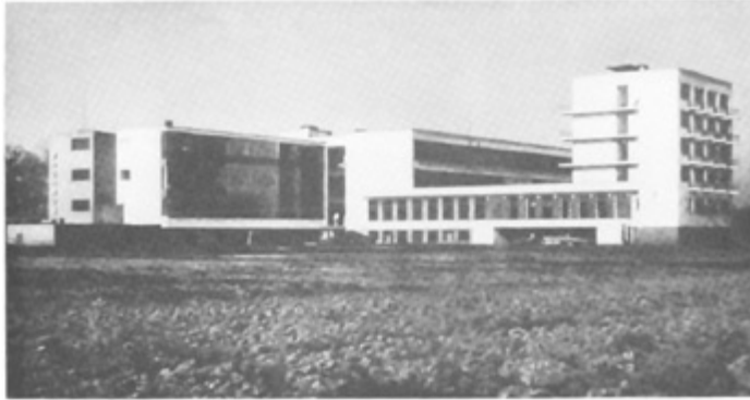
Fig. 4 / 1928, Dessau, reproduced from Wingler, Bauhaus: Weimar, Dessau, Berlin, Chicago , 400

By contrast, Walter Gropius denotes as some key features of the New Architecture represented by the Bauhaus its "simple and sharply modeled designs,"(97) overarching rejection of ornamentation,(98) and a sense of lightness created by the accessibility of natural light and rejection of "anchoring buildings ponderously into the ground."(99) Rationalization of architectural forms was seen as a "purifying agency"(100) Through it, "concise and economical solutions" amendable to aesthetic beauty would be found.(101) Insofar as the Bauhausers can be said to have pursued the fundamental principles of classical architecture, their products were much more in keeping with those sensibilities than Nazi German attempts at same. The latter included such failures as the German pavilion at the Paris International Exhibit of 1937, which demonstrated overt doctrinal confusion with its panache of unrelated structural elements.(102) Even where Bauhaus designs embraced verticality, habitable spaces were built to human scale in a matter suitably familiar to the humanism of the ancient Greeks. The Bauhaus building situated in Dessau closely conformed to these ideals. (Fig. 4)