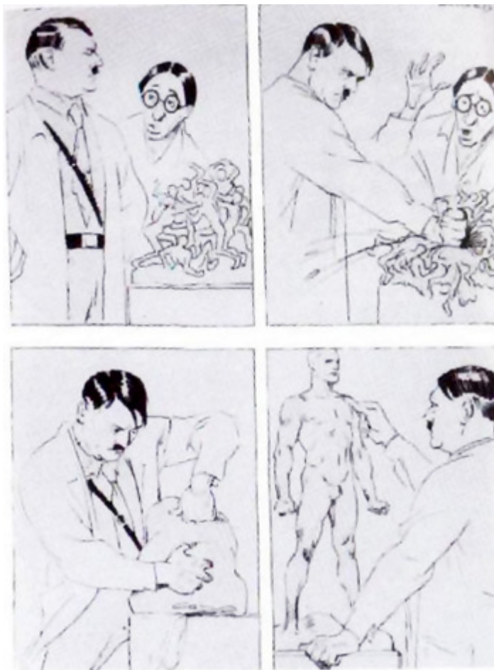
Fig 1 / O. Garvens, "The Sculptor of Germany," Kladderadatsch , 1933, vol. 46, no. 49, p. 7, reproduced from Michaud, The Cult of Art in Nazi Germany , unnumbered insert, illustration 2

Though it comes from the early movement, this cartoon is emblematic of what some have referred to as the "cult of art" in Nazi Germany. (38) A skewed aesthetic sensibility seemed to permeate every aspect of Hitler's psyche and, by extension, every element of the Nazi regime. Within this highly stunted social system, every element of stagecraft, ritual, architecture, music, sculpture and visual art was pressed into state service in some manner. The Nazi cultural goal was to bring about the advent of a new state of sociopolitical affairs that, while occurring under the auspice of the German search for a collective identity, was instead the product of a single man's theatrical vision: a vision in which the entire resources of a people became a medium to be brutally manipulated according to Hitler's will.