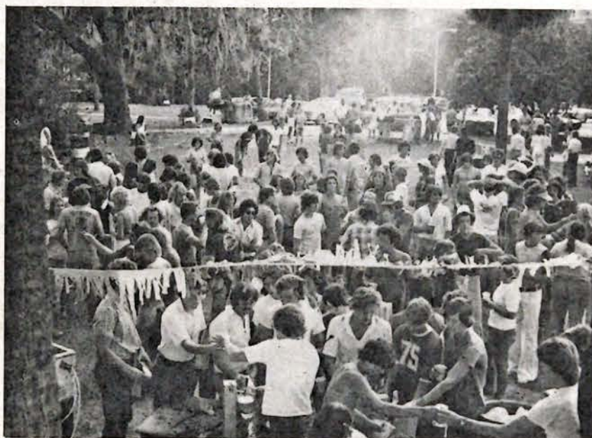
Oktoberfest, Fall, '76