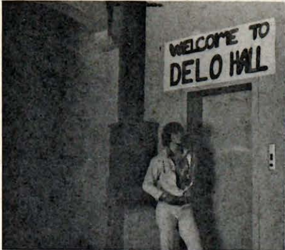
Freshman Orientation, Fall, '76