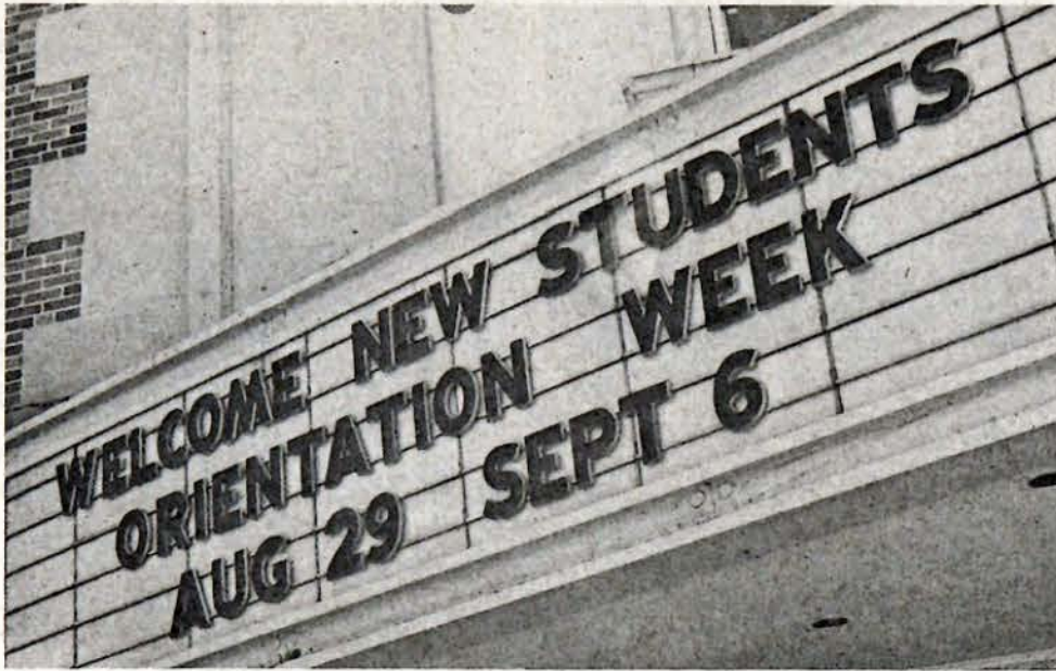
UT Orientation Week — August, 1976.