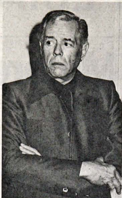
Desi Arnaz Visits UT, March, '77