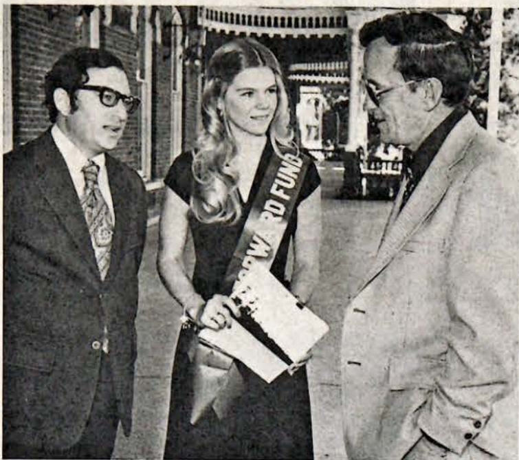
Forward Fund, February, '77