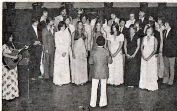
Christmas Sing, December, '76