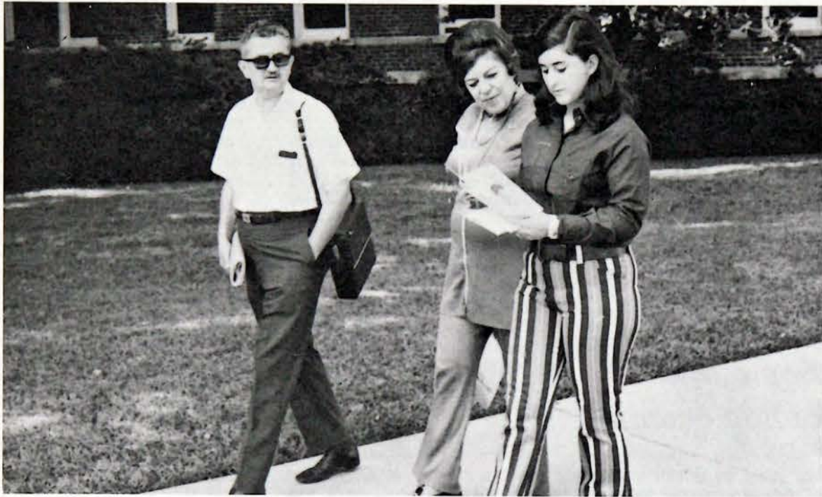
Once again parents invade the University of Tampa Campus for the Third Annual Parents Weekend.