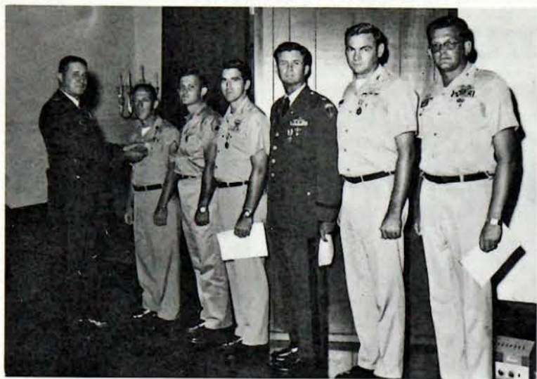
University of Tampa Bootstrap military students and Army personnel assigned to the University's ROTC program receive awards during the Veterans Day ceremonies at UT.