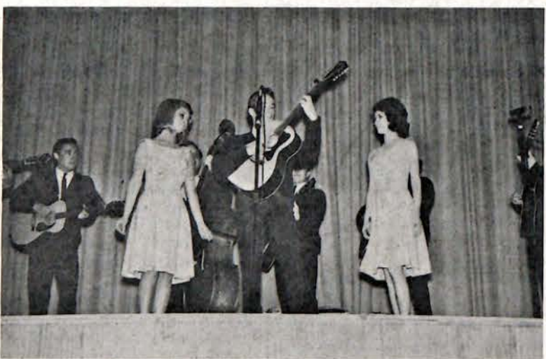
Serendipity Singers performing at McKay Auditorium.