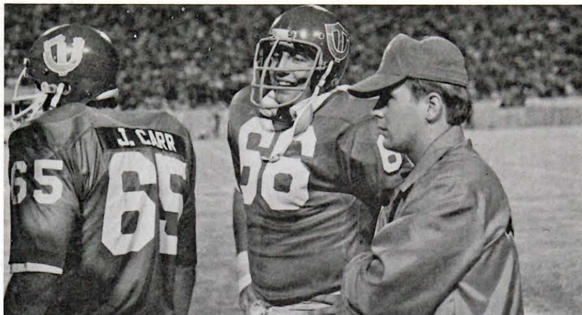
Spartan players smile as they watch the scoreboard at the Homecoming game against East Carolina.

Letters to the editor must be signed, but the name of the writer will be omitted on request. Letters should not exceed 300 words.