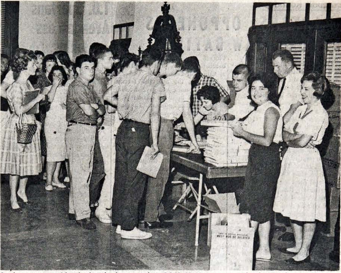
Students swarmed by the hundreds to get their 1960-61 Moroccan yearbook. (Story page 1)