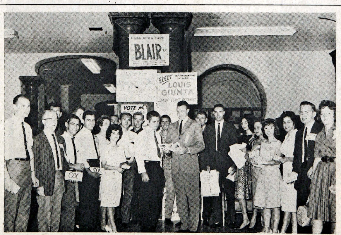
Campaigners pause a moment during staunch Student Congress elections.