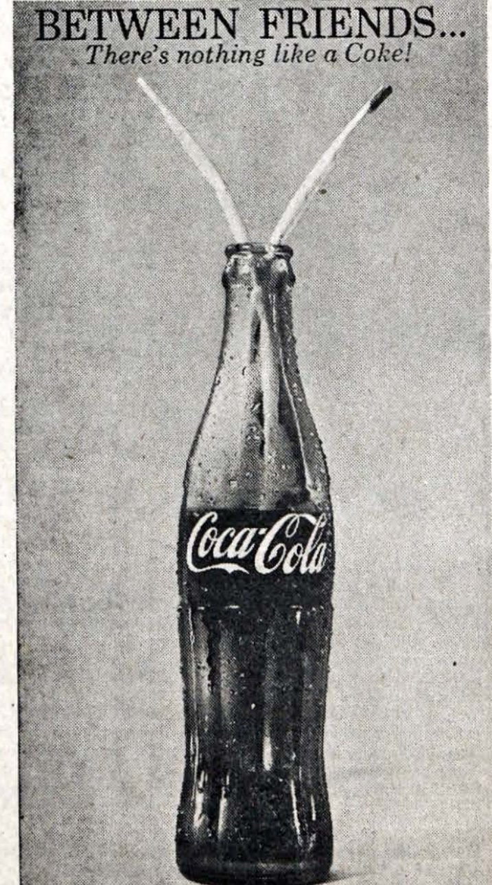
Get that refreshing new feeling with Coke!

COPYRIGHT @ 1961, THE COCA-COLA COMPANY COCA-COLA AND COKE ARE REGISTERED TRADEMARKS